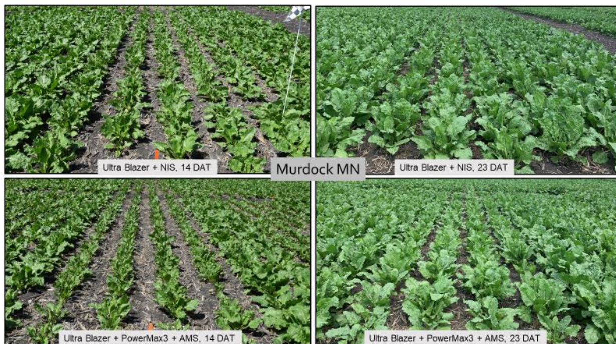
Figure 3. Sugarbeet regrowth following Ultra Blazer or Ultra Blazer mixtures with Roundup PowerMax3, Murdock, MN, 2022.

Not all yield parameters were significantly different at each individual location; however, we have elected to combine yield data and present differences across all locations in Table 5. Root yield and recoverable sucrose from a single application of Ultra Blazer plus NIS, Ultra Blazer plus COC, or repeat applications of Ultra Blazer plus NIS, generally were the same as the glyphosate control. Root yield and recoverable sucrose were less when Ultra Blazer was mixed with Roundup Powermax3 and Amsol or Amsol plus NIS. Ultra Blazer plus Roundup PowerMax3 consistently reduced root yield across locations compared with either product applied alone.