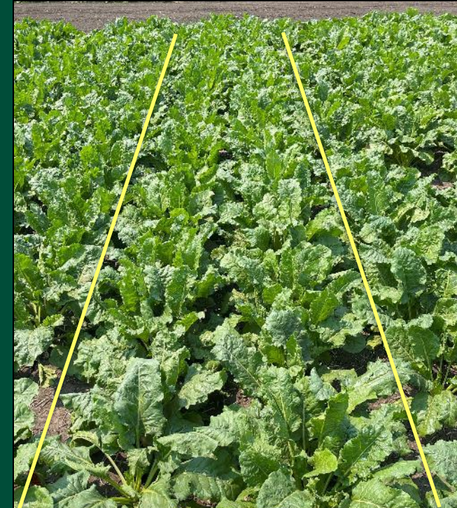
Poncho Beta + Mustang Maxx 4 oz DIF