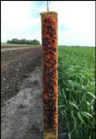
Root Maggot Flies / Trap (RRV Average)