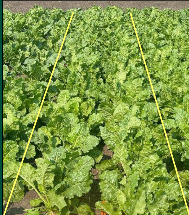
Counter Band 7.5#