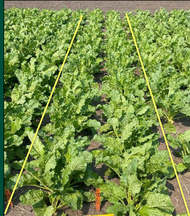
Mustang Maxx 4 oz DIF